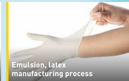
Emulsion, latex manufacturing process