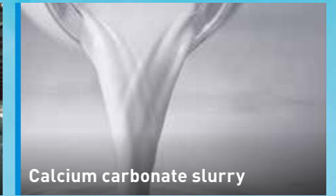
Calcium carbonate slurry