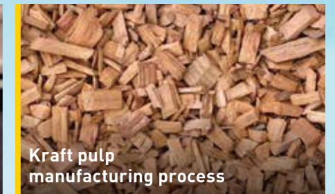
Kraft pulp manufacturing process