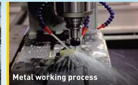
Metal working process