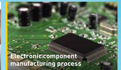
Electronic component manufacturing process