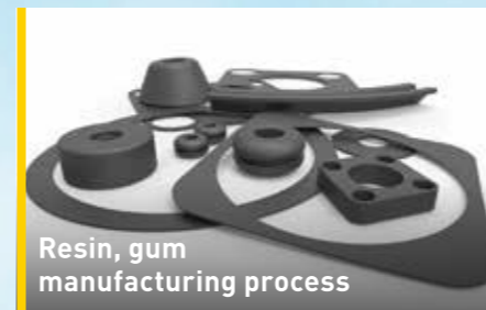
Resin, gum manufacturing process