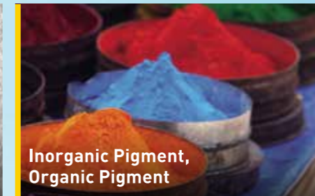
Inorganic Pigment, Organic Pigment