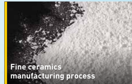
Fine ceramics manufacturing process