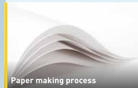
Paper making process